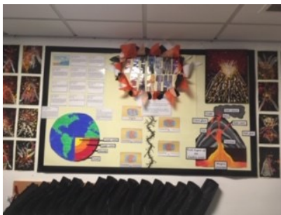
Geography in Year 3, children have been learning about volcanoes.