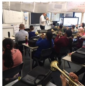
All children in school learn a musical instrument throughout the year. Year 6 are learning the trumpet! Ask your child which instrument they are learning.