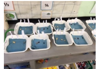
Science in Year 2, children have been learning about plants.