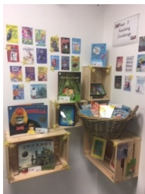
Every child has access to high quality texts and take part in a reading challenge. Here is Year 3's selection of books. Every children should be bringing one home, if not speak to your class teacher.