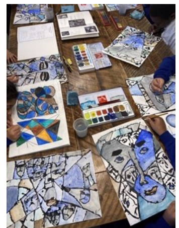
Art in Year 6 linked the topic of World War 2 in History.